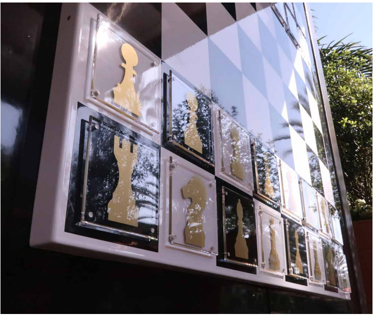
Contact a product manager for more information.

Phone: +1.888.219.2126 Email: info@architecturalmaterials.com