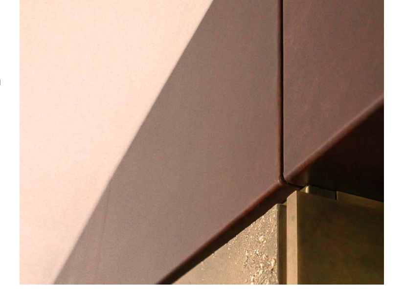
Contact a product manager for more information.